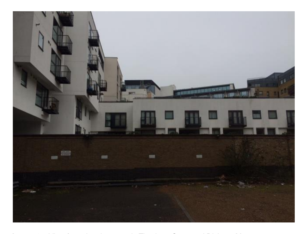
Image 1 - View from the site towards Thackery Court and Dickens Mews