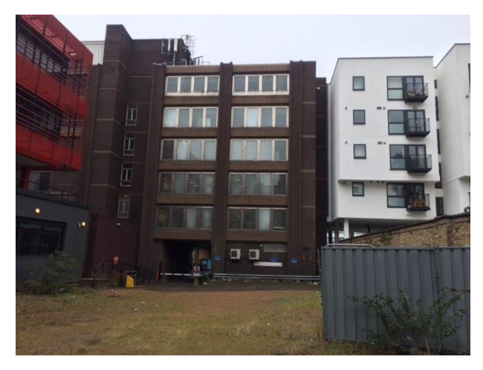
Image 2 – View from the site towards 6-storey office building fronting Turnmill Road.